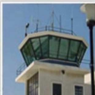
CNS / ATM