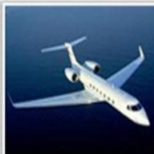
Aircraft & Spares